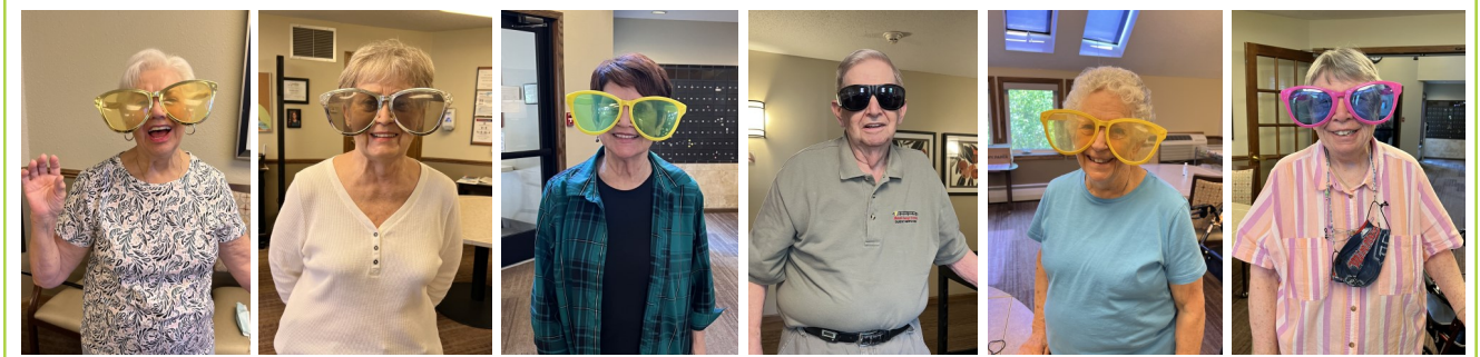
Daily fun at Westwood Ridge! Sunglasses Day